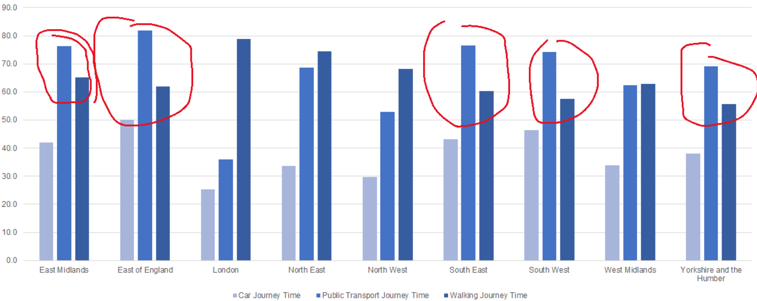
Accessibility (Average Journey Time in Minutes) to Hospital Trusts weighted with development